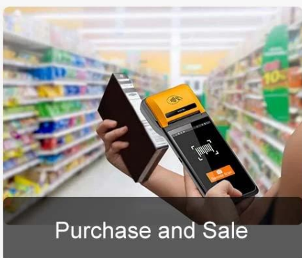
Purchase and Sale