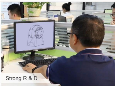
Strong R & D