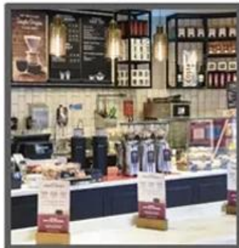
Mile Tea Store