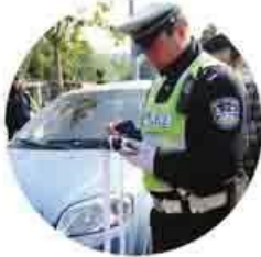
Traffic police enforcement