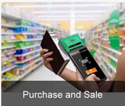
Purchase and Sale