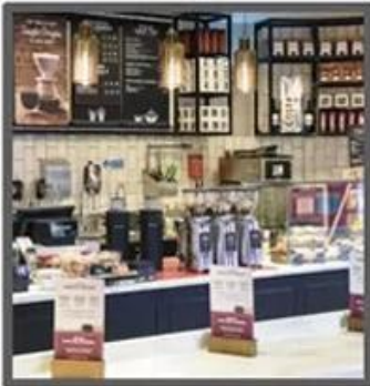
Mile Tea Store