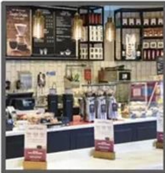
Mile Tea Store