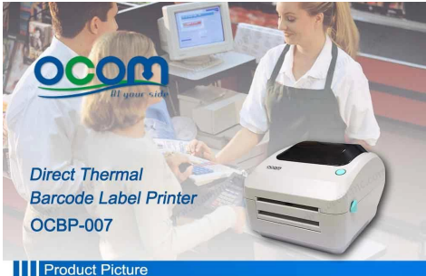
Direct Thermal Barcode Label Printer OCBP-007